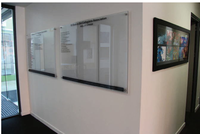
The Hall of Fame and Role of Honour Boards on display in the new Performing Arts Centre at St Bede's College