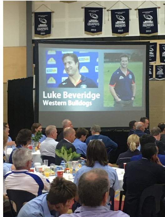
An enjoyable morning and over $5,000 raised for MAD.

Bulldogs coach and Old Collegian Luke Beveridge spoke of the significant role models in his life. Students asked questions about his time at St Bede's College and Luke spoke frankly about those who have helped to shape the person he is today.